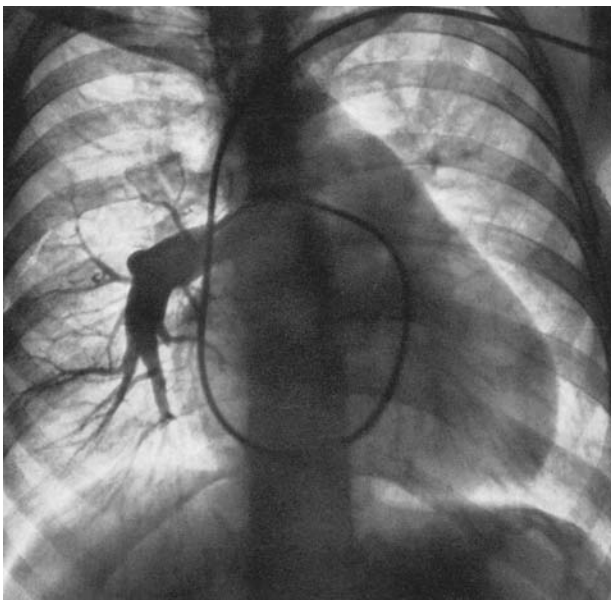
Fig. 4. Selective angiography of the lung vessels, performed in Cologne 1949.