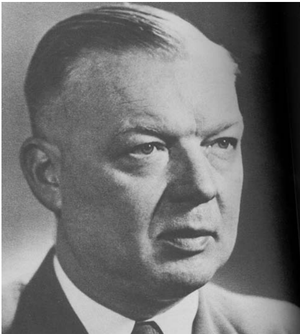
Fig. 8. Werner Forßmann.

Weeks later as Forßmann visited us again in the Cologne Clinic; he gave us many further details particular to the Nobel Prize Awards. I believe I can still remember almost everything he said, but this would exceed the framework of these short statements. Some of his narratives concern the year 1929, how he got to know the operations nurse in Eberswalde a little more closely, with the intention of having an aid when carrying out the tests on his own body. Thereby Forßmann smiled reminiscently and mentioned how the eyes of the nurse opened wide in shock, as he did not test only once whether he could go up a vein in the arm with a urological catheter, as he initially indicated to her, but pushed it further and further up to a mark which he had previously made on the catheter. Then he went into the cellar of this building where he had previously prepared an x-ray machine for the purpose of ascertaining that the catheter had actually entered the heart and he was evidently still alive, which was in contrast to the official medical doctrine at that time.