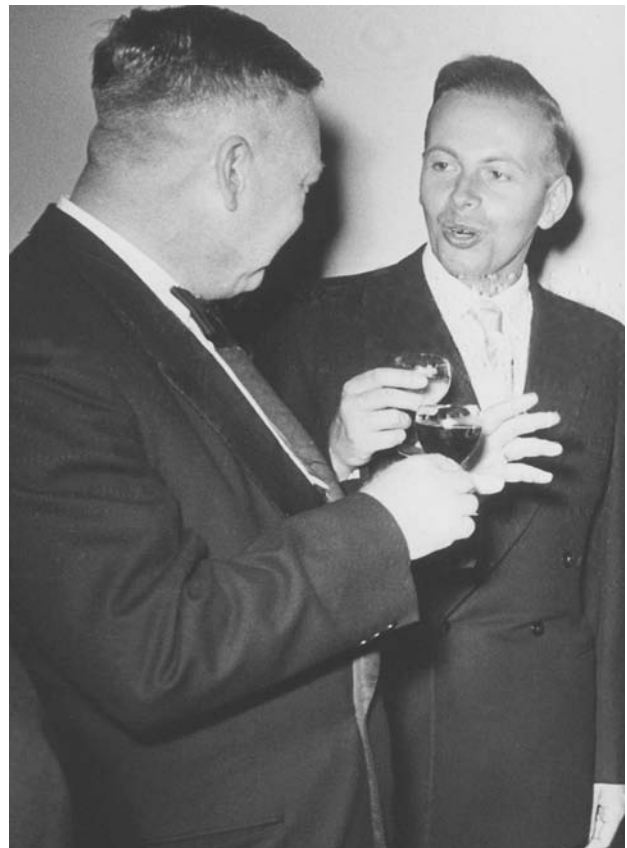
Fig. 5. Forßmann and the author at the Congress of Chest Physicians, 1955. ▶